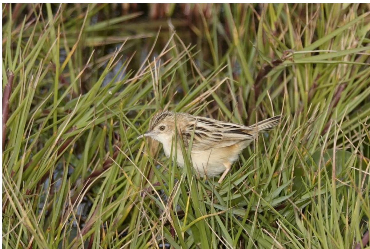
Zitting Cisticola was only seen at one location