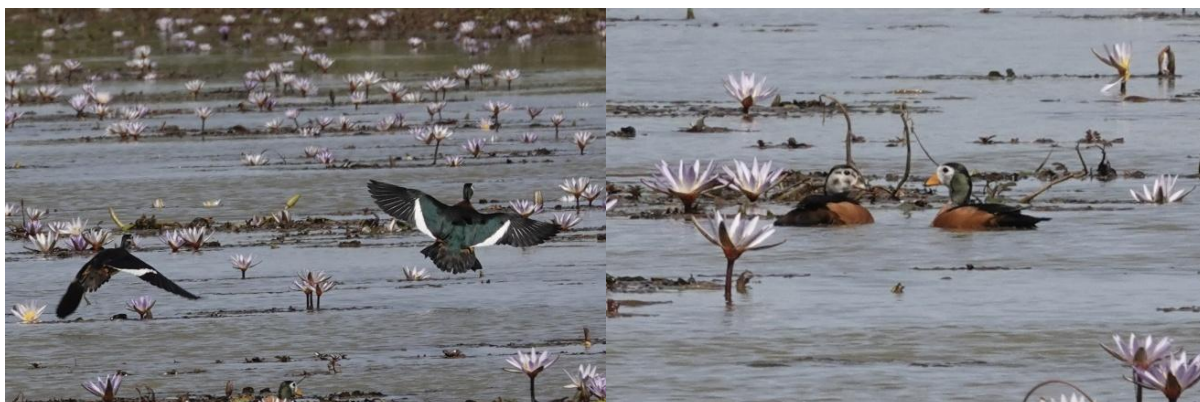
African Pygmy Geese at Djoudj

A loose group of at least 12 at Djoudj was the only sighting.