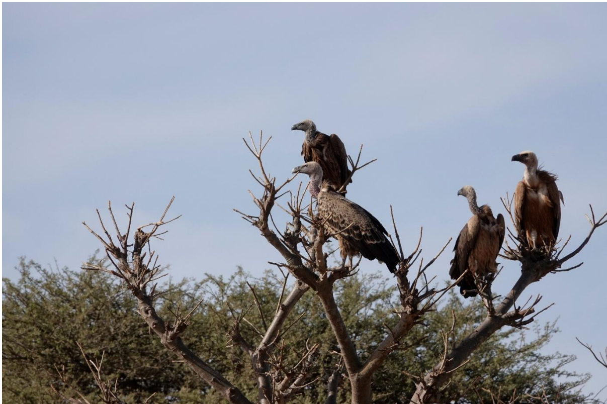
Three species of Gyps vulture resting after feeding in the north of Senegal

Only seen in the area between Thies and Richard Toll, gathering with other feeding vultures.