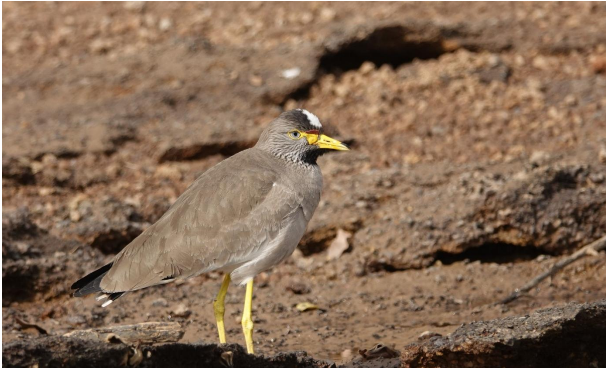
Only immature African Wattled Lapwings were seen on the 2026 tour, on the Gambia River