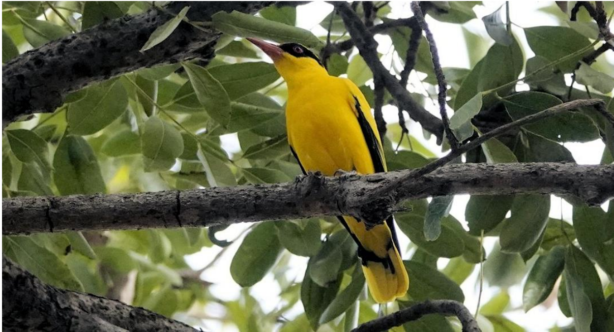
African Golden Orioles were relatively common near Toubakouta