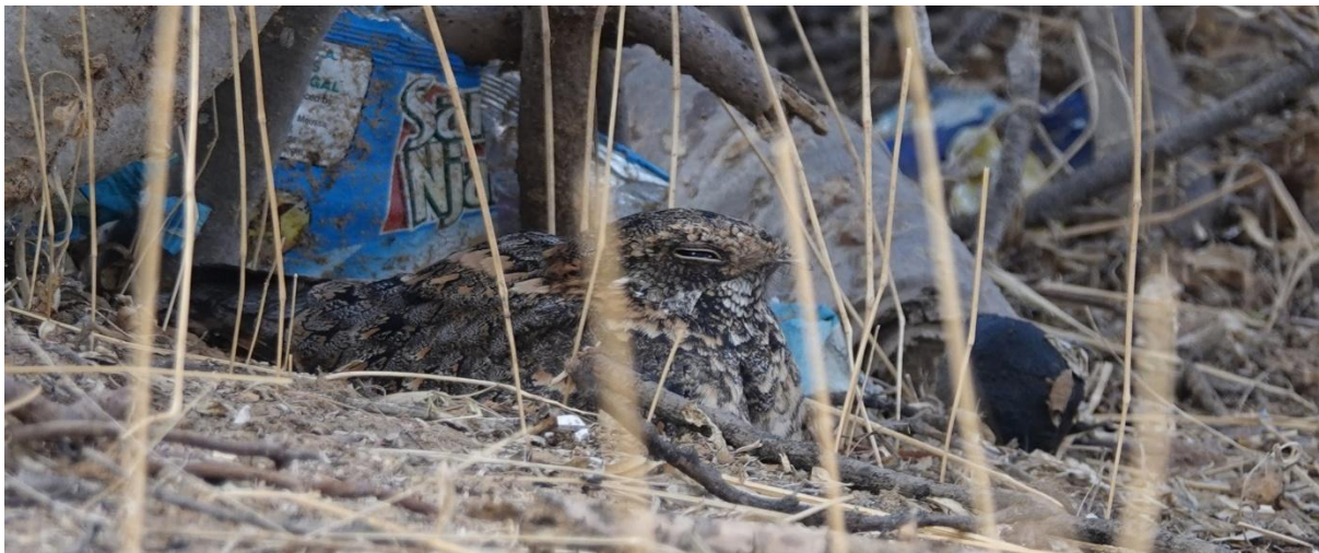
A Standard-winged Nightjar roosting in a hedgerow near Richard Toll

Amazing views during the day of a pair roosting together, not far from Podor.