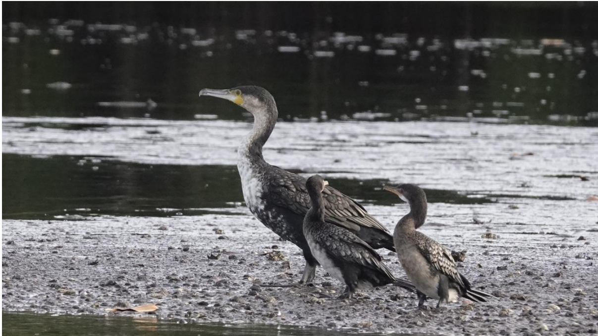
Great Cormorant with two Reed Cormorants in the Saloum Delta

Fairly common in freshwater wetland areas in the north, where seen in small numbers.