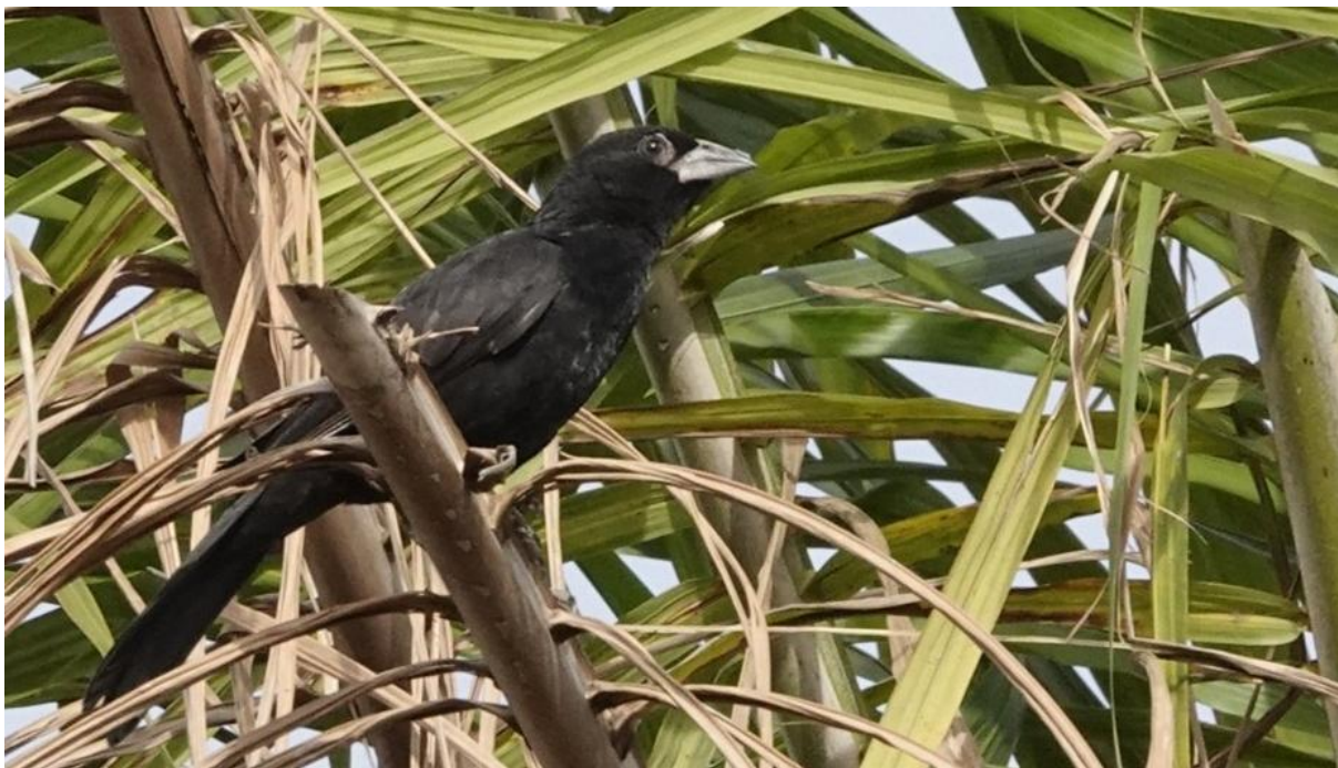
White-billed Buffalo Weavers were regularly encountered during the tour