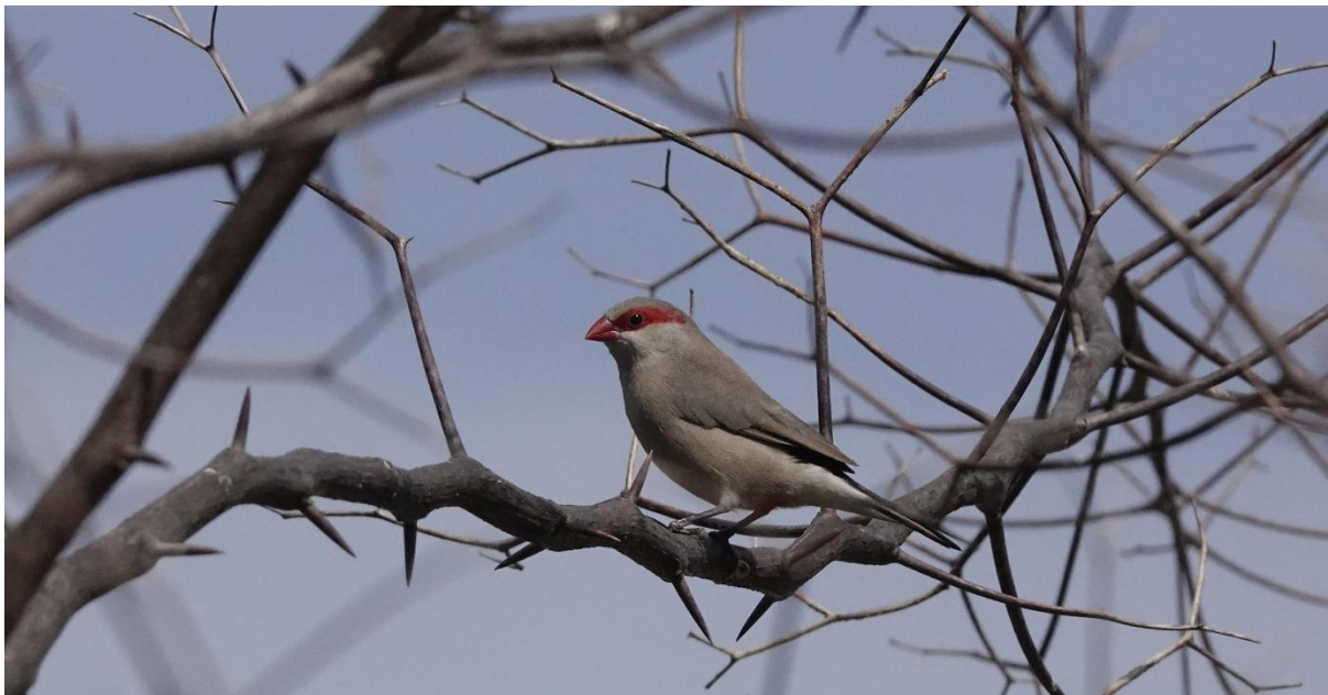
Black-rumped Waxbill was encountered twice in the south during the tour

Small numbers seen daily near Toubakouta.