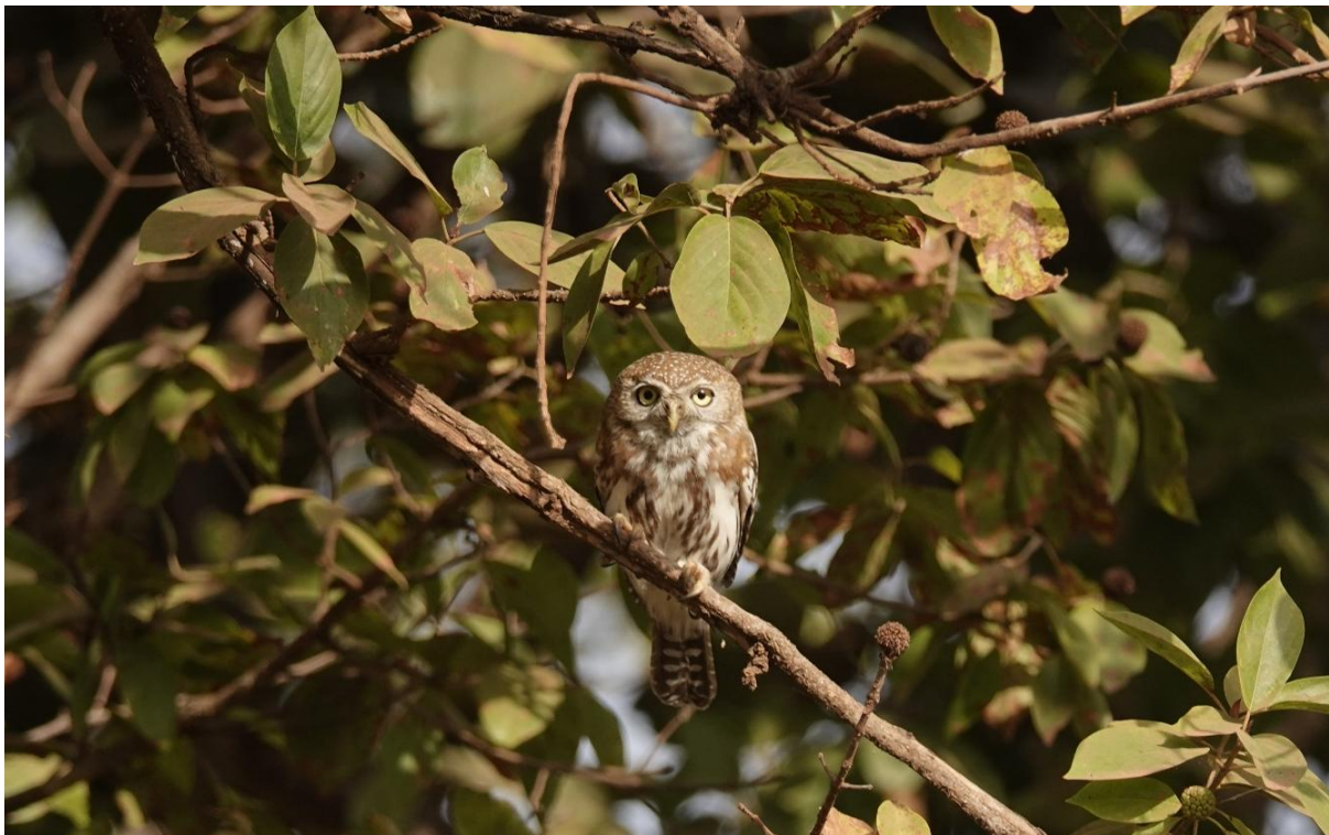
Pearl-spotted Owlets were seen several times during the daytime

Widespread with several heard and a few seen.