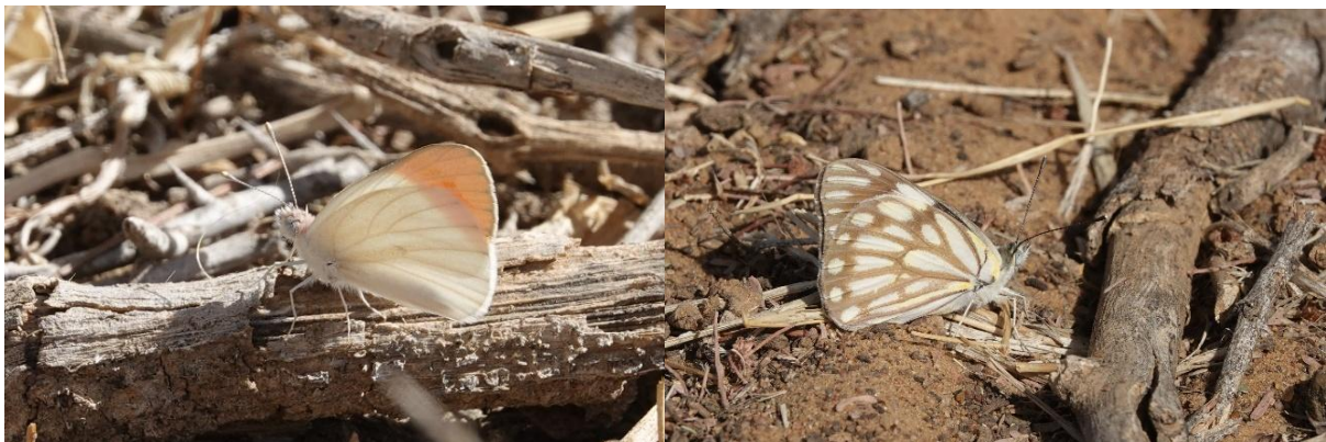
Butterflies seen included an unidentified Tip ( Colotis sp.) and Pioneer White Belenois aurota (right)