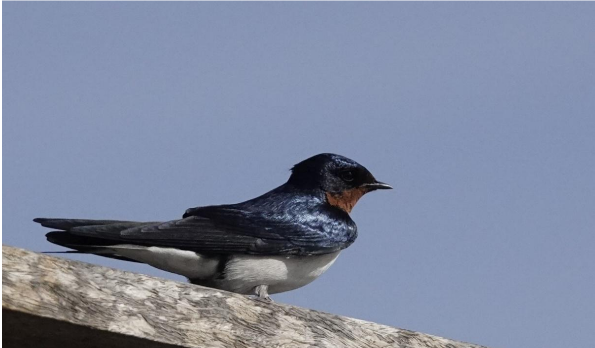
A Red-chested Swallow in the Saloum Delta

A few over the Gambia River, and a dozen or so near our hotel in Toubakouta.