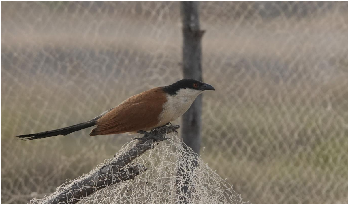
Senegal Coucals were seen at many sites in the south, and in a variety of situations

Seen in small numbers throughout the trip, but mostly in the south.