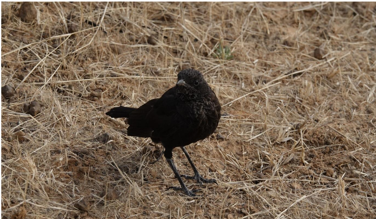
An Anteater Chat near Richard Toll

Seen on three dates, with eight of the nine birds being recorded between Podor and Richard Toll.