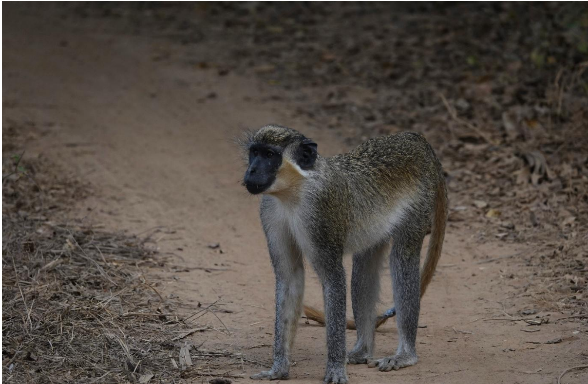
Green Monkey was seen in small numbers at Wassadou