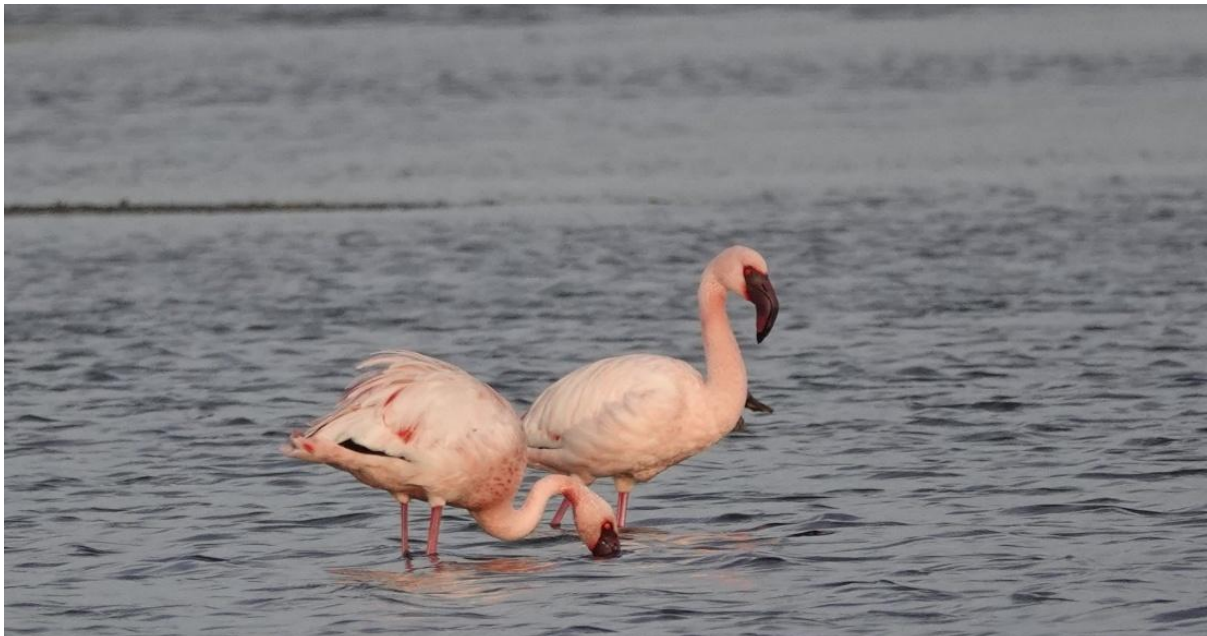
Large groups of Lesser Flamingos were seen at Djoudj

Only seen at Djoudj and near Richard Toll, with probably about 500 seen in total.