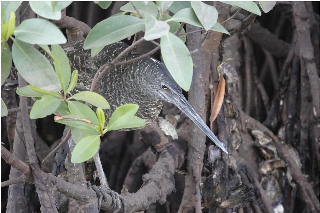
One of the four White-crested Tiger Herons seen on our Senegal tour in 2026