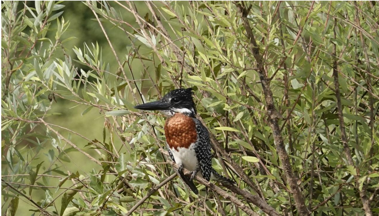
A male Giant Kingfisher at Wassadou

At least three on the Gambia River at Wassadou.