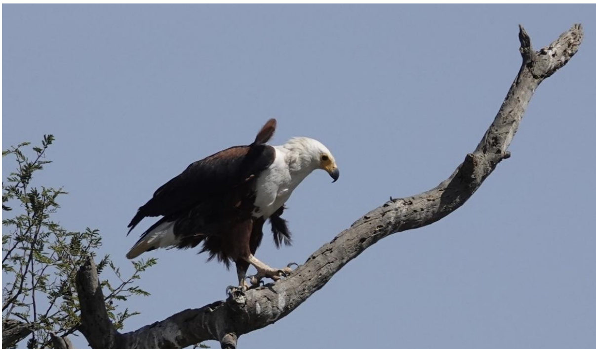
An African Fish Eagle in the Djoudj Bird Sanctuary

Found on three days during the tour, with two on each date.