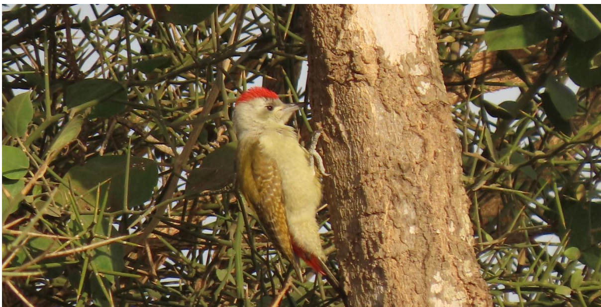
African Grey Woodpecker was seen at several sites

The most widespread woodpecker, seen regularly during the tour, with up to four together.