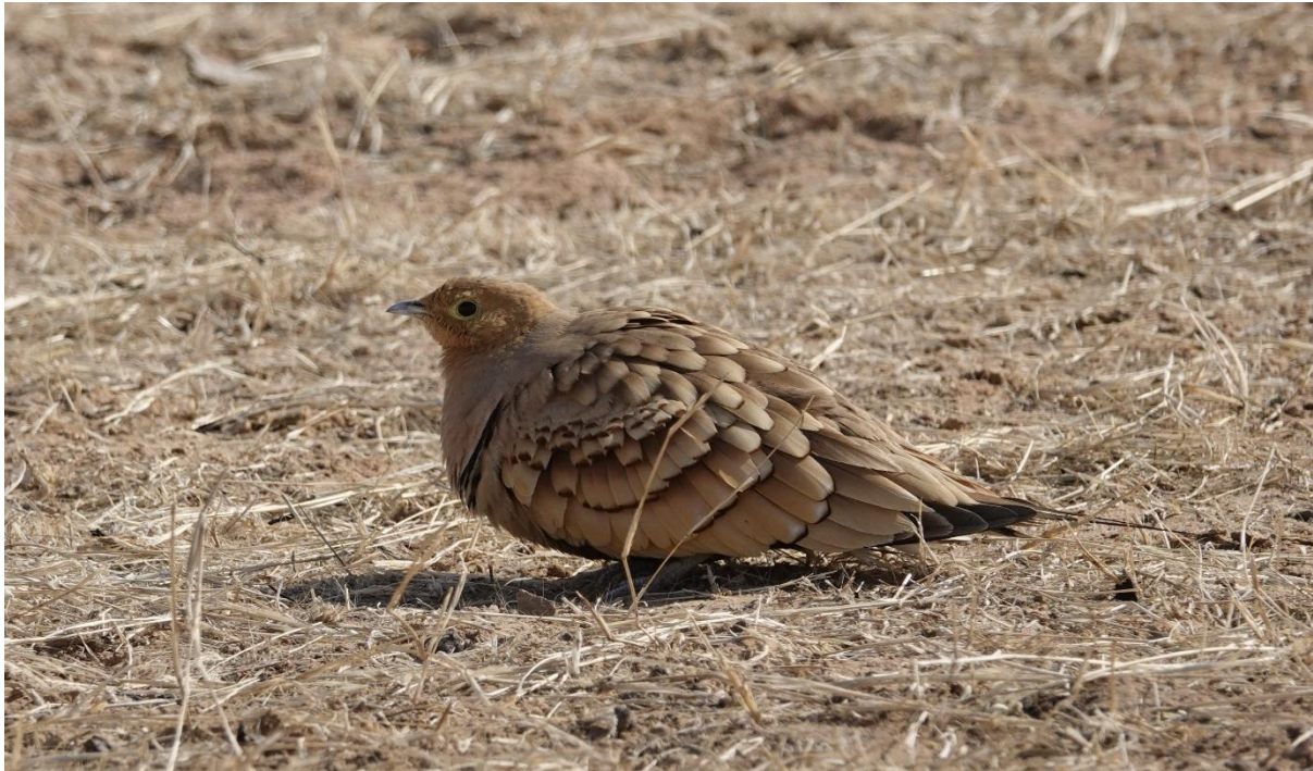
We had great views of Chestnut-bellied Sandgrouse using our vehicle as a hide