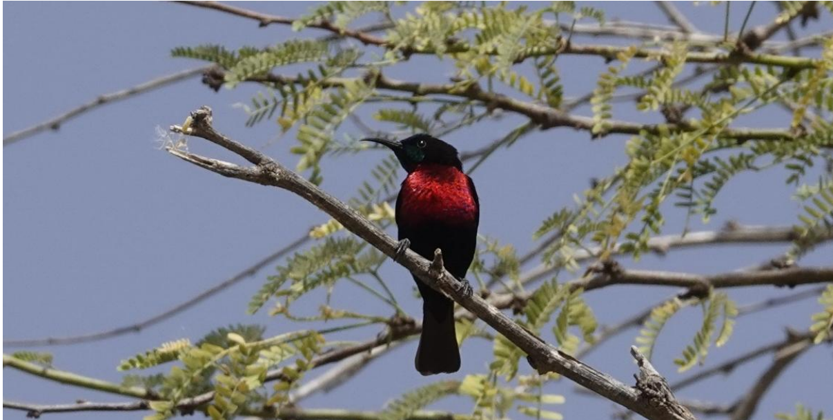
Scarlet-chested Sunbird was seen occasionally during the tour

Widespread, with occasional sightings throughout the tour.