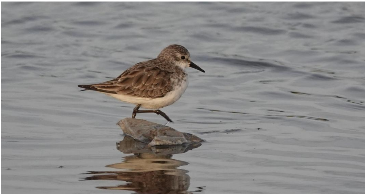
Wintering Little Stints were much more commonly seen on this tour when compared to previous years

At least fifty in flooded agricultural fields near Podor, and probably 100 or more at Djoudj and around St Louis, and smaller numbers in the Saloum Delta.