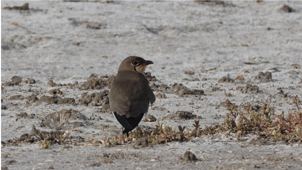
One of the many Collared Pratincoles in an open dry muddy area at Trois Marigots

First seen near Podor, and later found in Djoudj and Trois Marigots where more than 50 were seen.