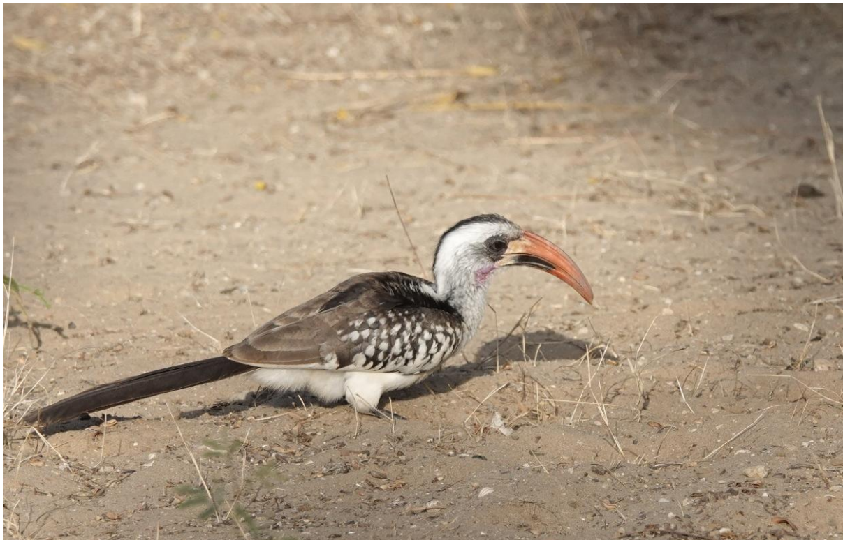
Western Red-billed Hornbills were commonly seen during the tour