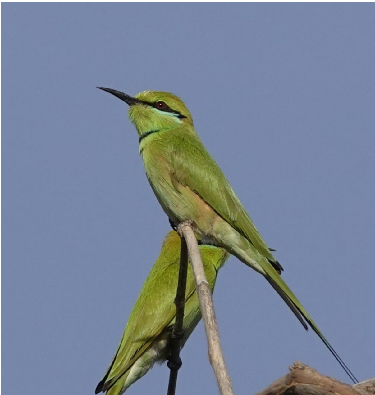
African Green Bee-eaters were seen regularly in the north

Only observed in the Podor area and near Richard Toll.