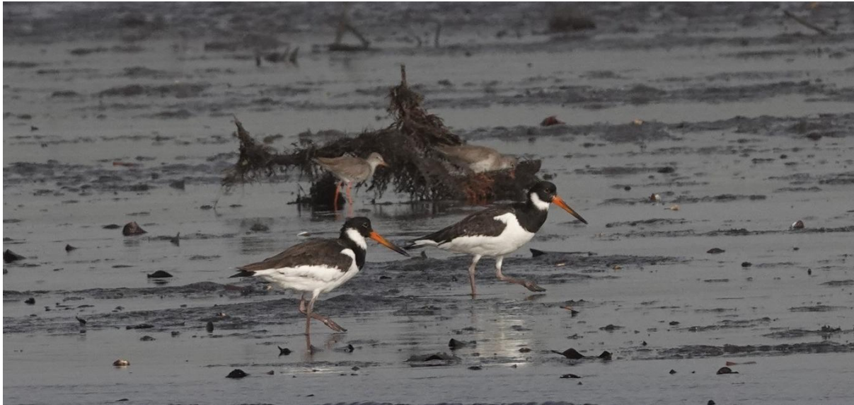
Small numbers of Eurasian Oystercatchers winter on the mudflats of larger rivers in Senegal

Two on the Senegal River near St Louis and four in the Saloum Estuary