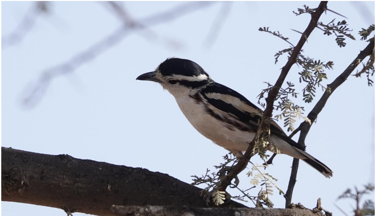
Brubru was observed in tall Acacia trees in the north