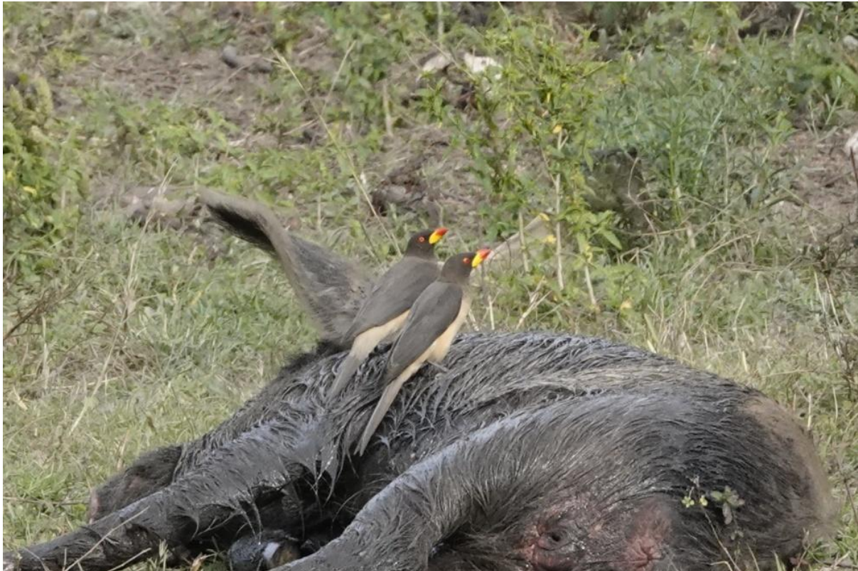
Yellow-billed Oxpeckers on a domestic pig near Toubakouta

Only observed twice, once in the north, and once near Toubakouta.