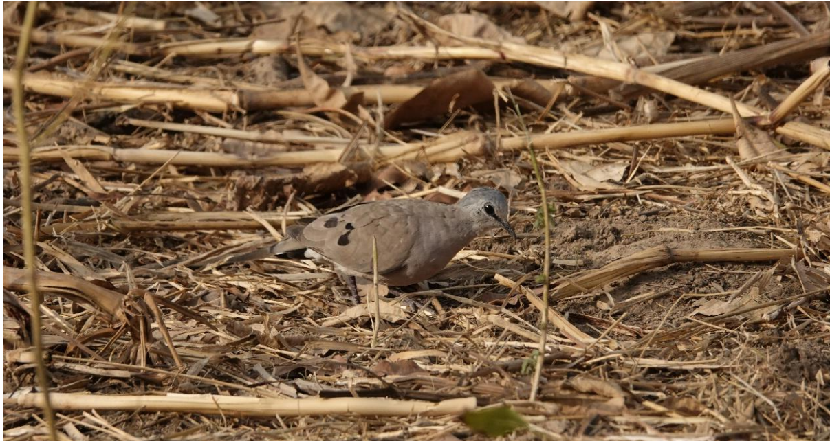
Black-billed Wood Doves were heard regularly and seen occasionally near Wassadou

Regularly seen during the second half of the tour.