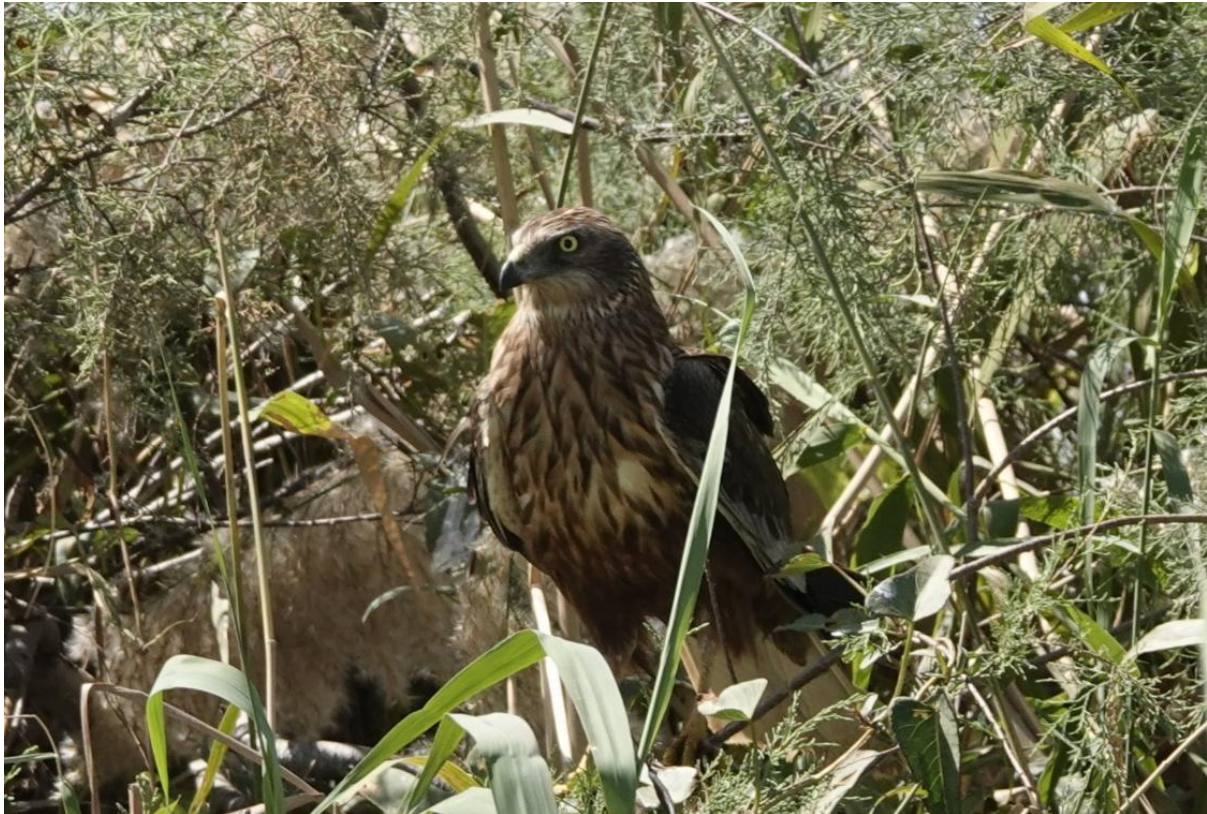
A female Western Marsh Harrier at Djoudj Bird Sanctuary