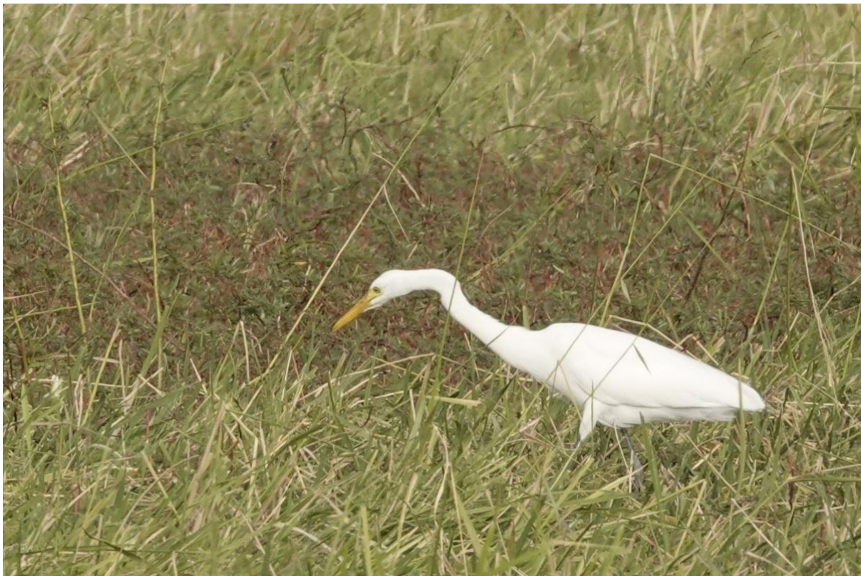
Yellow-billed Egret in wetlands near Keur Mama Lamine