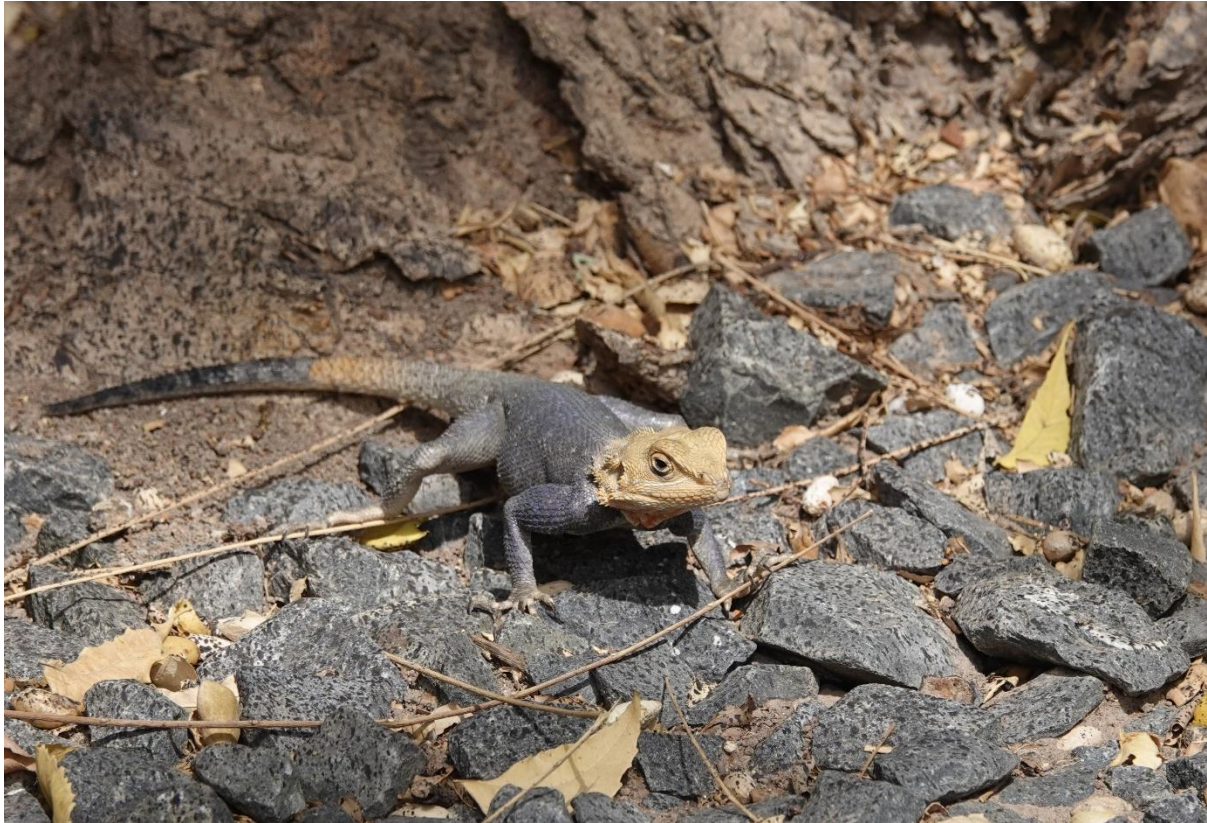
One of the Rainbow Agamas seen outside our hotel in Kaolack

This species was seen well at several locations.