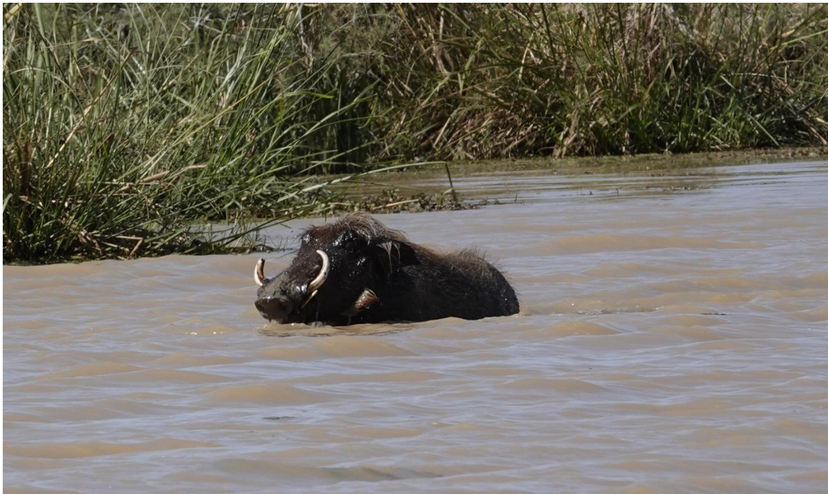
Common Warthog in the swamps of Djoudj Bird Sanctuary

Small numbers at Djoudj and a couple at the wetlands near St Louis.