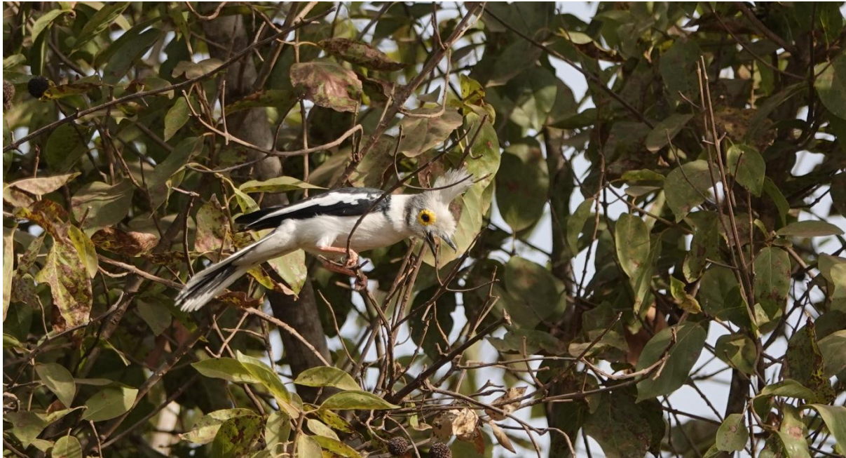
One of a group of White-crested Helmetshrikes near Wassadou

Seen only at Ranch de Bango, where a pair was seen.