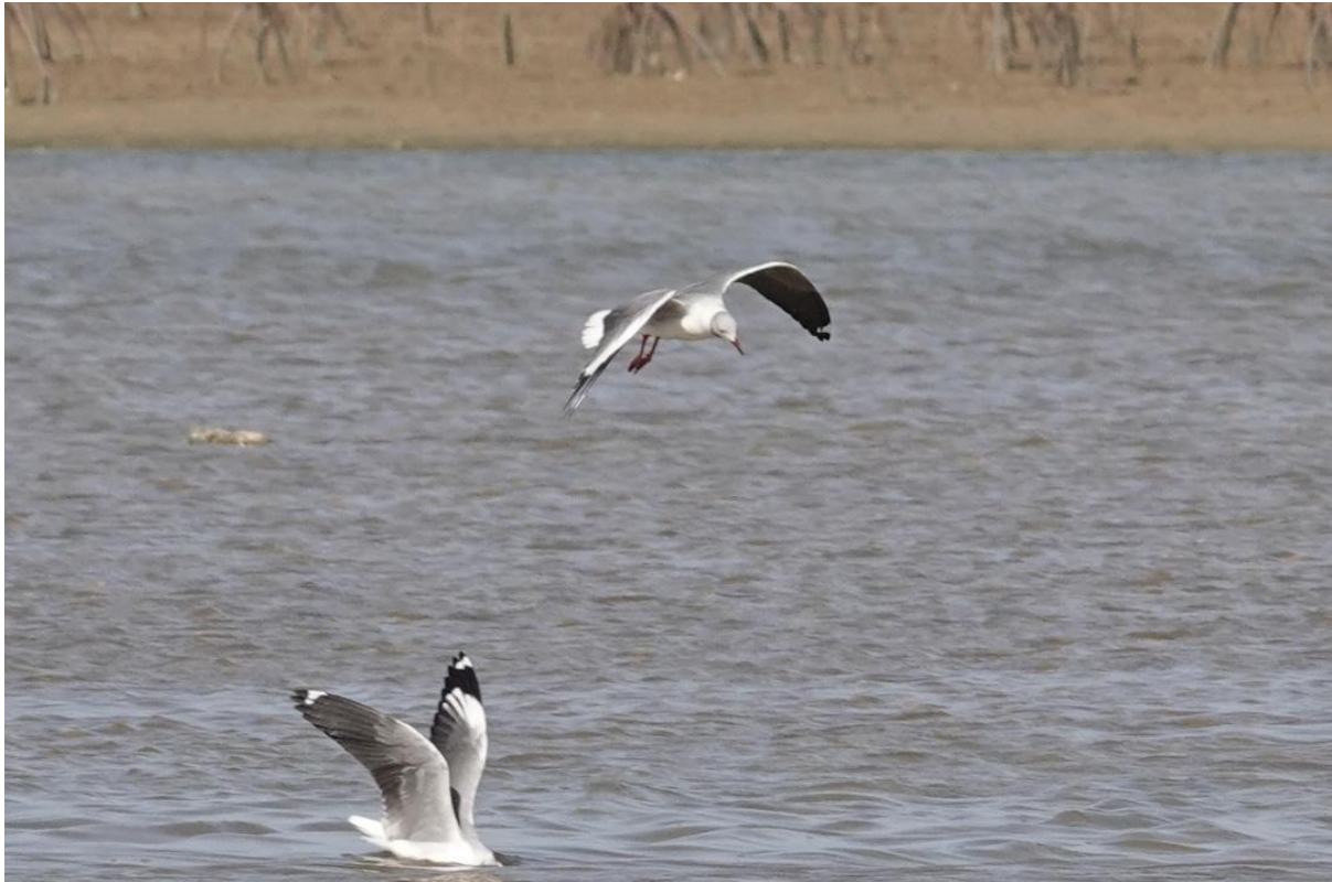
Grey-headed Gulls have a very distinctive wing pattern