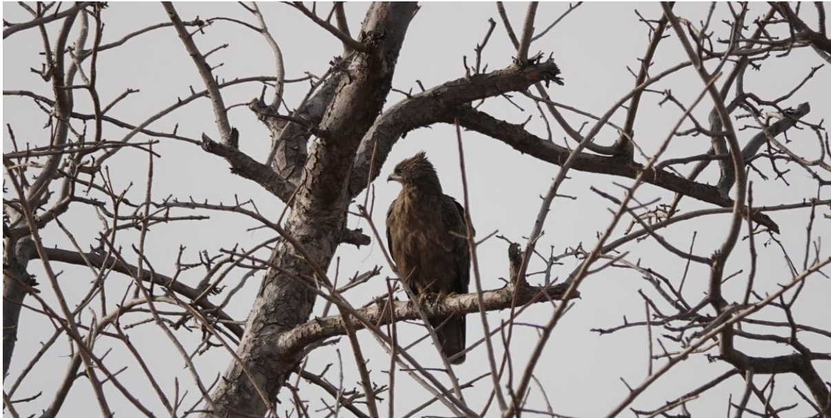
A Wahlberg's Eagle, showing the distinctive short crest and overall brown colouration