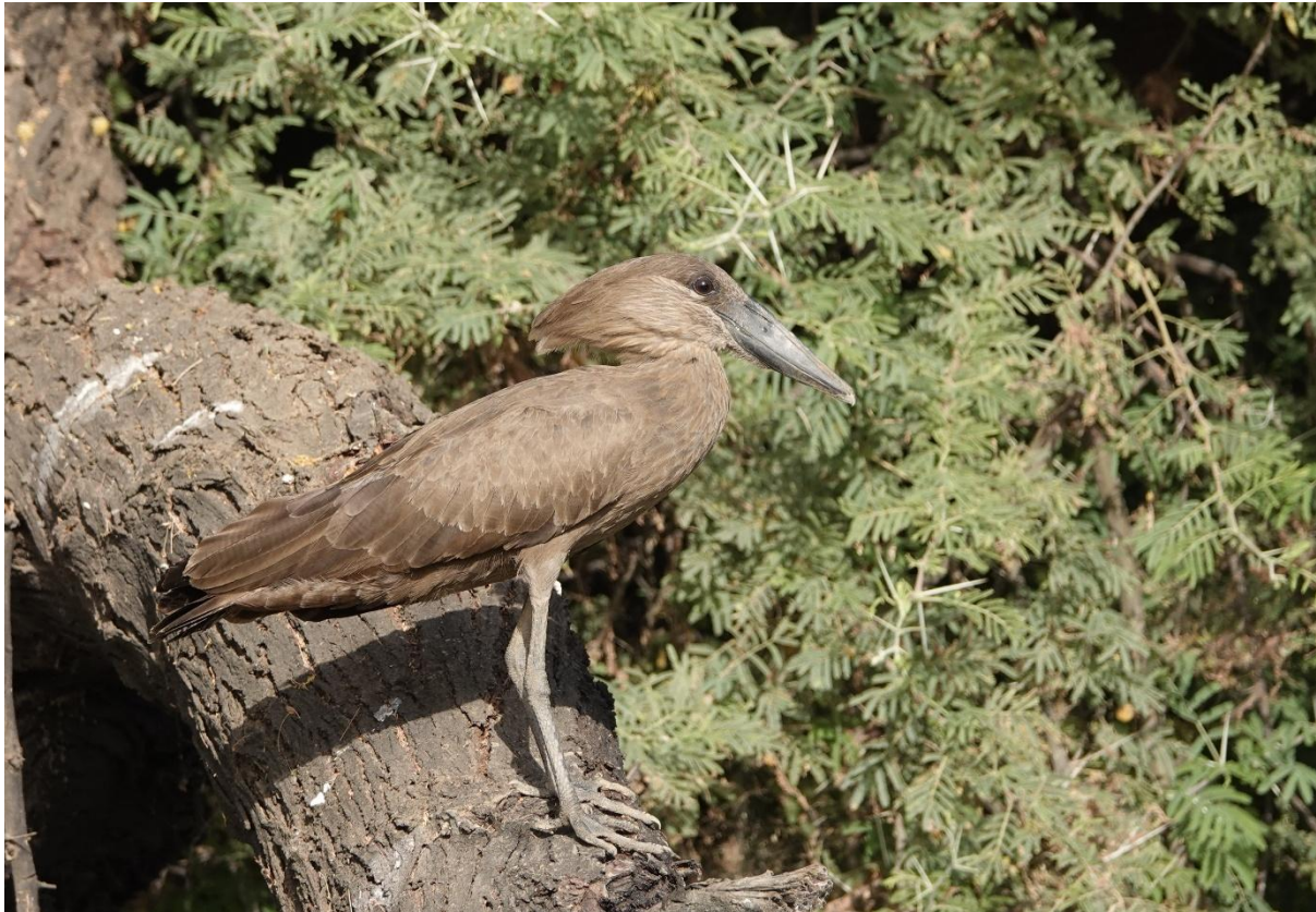
A Hamerkop near Podor

Seen regularly on five days of the tour.