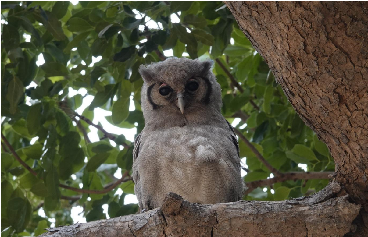
A powerful Verreaux's Eagle Owl with eyes on our group!