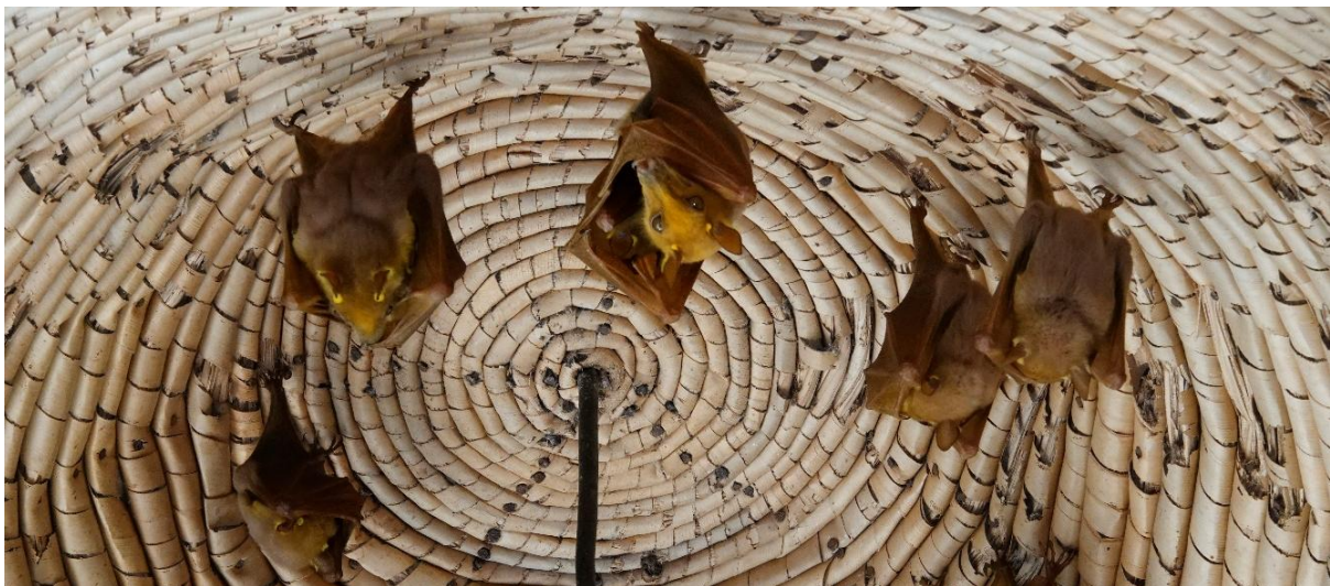
Gambian Epauletted Fruit Bats were roosting during the day at our hotel in Tambacouta

Occasionally seen in the drier northern parts of Senegal.