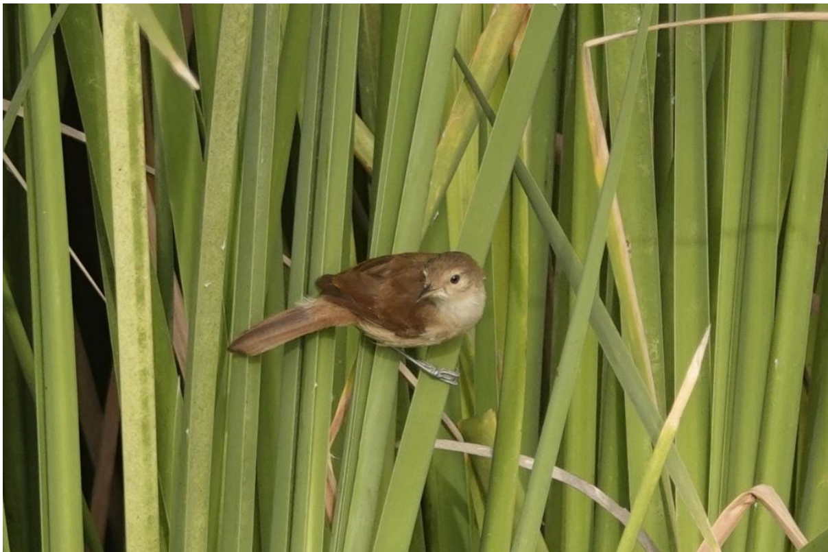
Greater Swamp Warblers were seen surprisingly well at Trois Marigots

Heard at Djoudj but only seen well in the reedbeds of Trois Marigots.