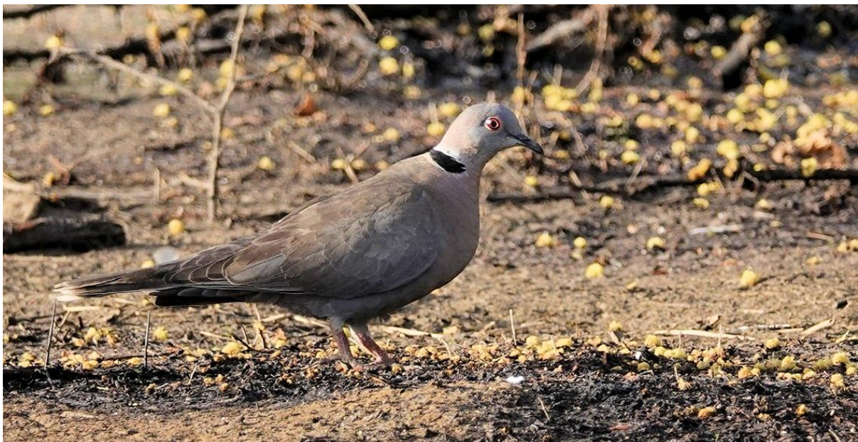
Mourning Doves were seen throughout the tour

Ubiquitous and common, and seen nearly every day.