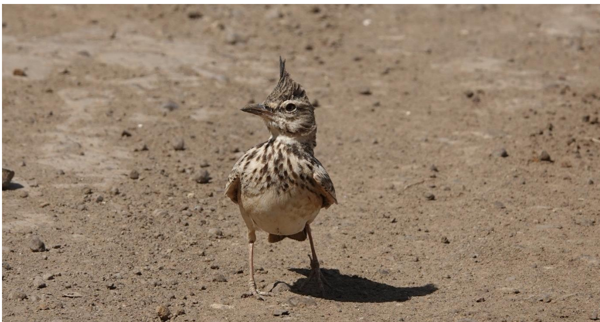
Crested Larks were common in the north

A total of six on three different dates.