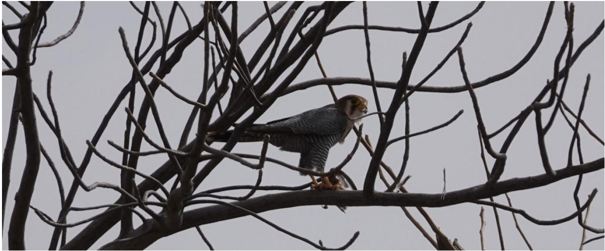
Red-necked Falcon was observed twice during the tour