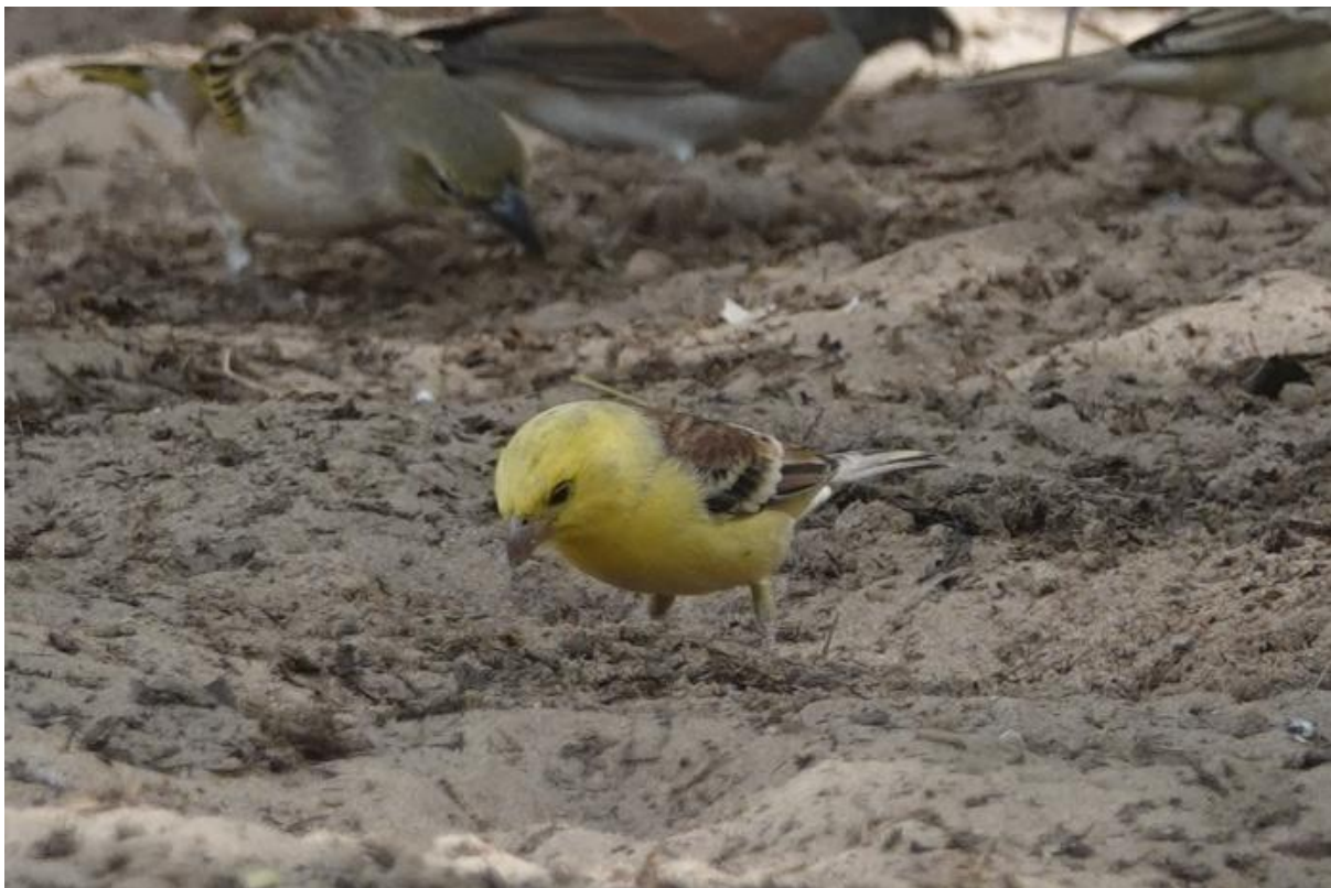
Sudan Golden Sparrows were seen often during the tour

Abundant in the north where large flocks were encountered daily, but also locally in the south.