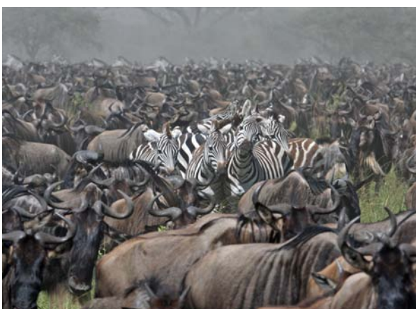
(Trip photos, clockwise from top left): A pair of Heuglin's Coursers (the male with its crest raised) on the lookout in the early morning • Lilac-breasted Rollers are always pleasing • A close Crested Francolin walks past the group • A group of Zebra amongst Wildebeest sweeping majestically across the plain • Superb Starlings are...well superb! • One of several Servals walks stealthily through the long grass