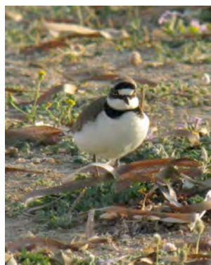
Little Ringed Plover

From the balcony of the room, we noted a flock of Black-headed Gulls flying north, followed by a flock of very pale looking passerines which we are assuming to be Short-toed Larks. We took a pre-breakfast walk along the shore in front of the hotel and towards the headland. All the usual suspects were found on the earthy field behind the beach and we returned via the cultivated field in front of reception finding several further Short-toed Larks. After breakfast we headed off in the bus for our second visit to the Asprokremnos Dam Pools. Here we found two Spotted Crakes though there was no sign of a reported Little Crake. A Chukar was sitting out very obviously on the dam itself.