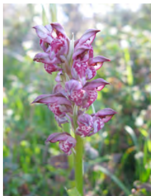
Orchis [coriophora] fragrans