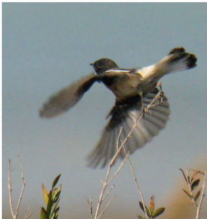
Caucasian Stonechat (variegata)