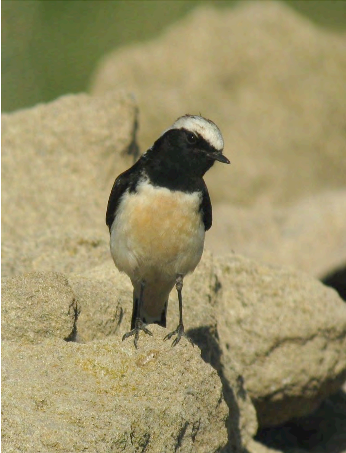
male Cyprus Wheatear