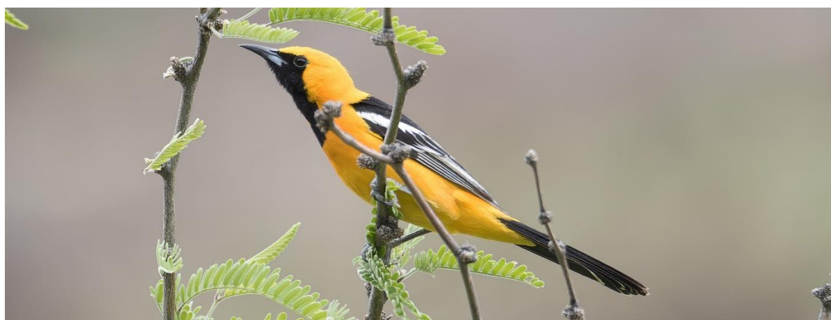
Hooded Oriole