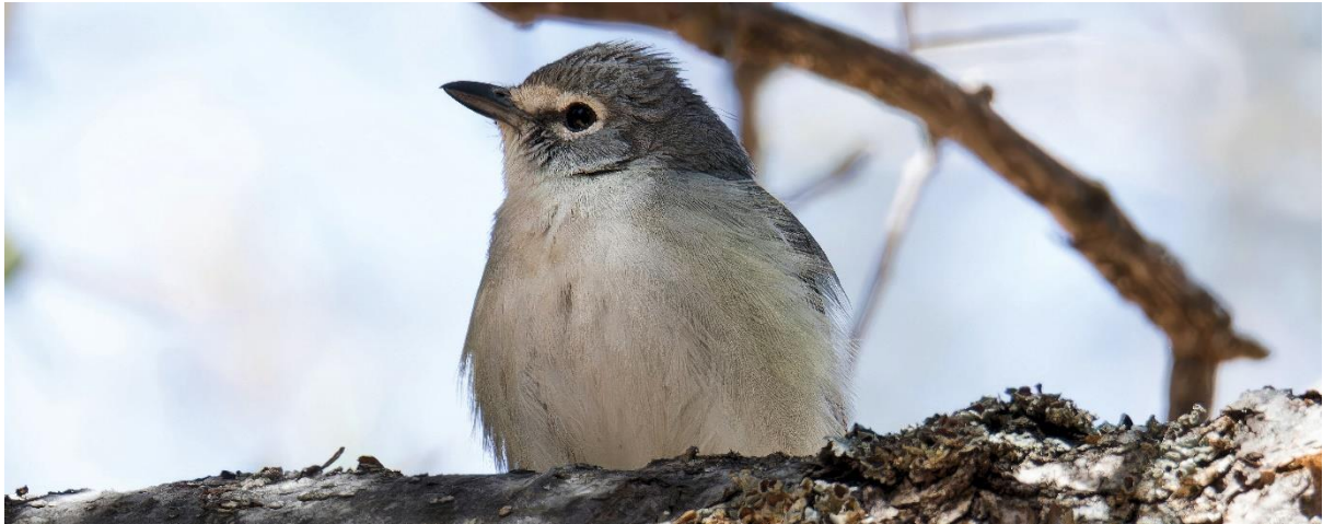
Plumbeous Vireo

One was seen high in the trees at Bear Wallow on Mt. Lemmon. Another was at the De Anza Trail in Tubac, and one more at Miller Canyon in the Huachuca Mountains.