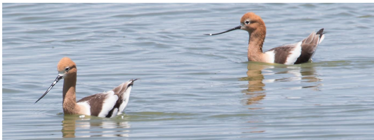
American Avocet

Up to eight at the Willcox Sewage Pond on 7 May.