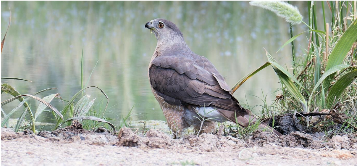
Cooper's Hawk

Several sightings: along Paseo del Canto in Green Valley, at Pena Blanca Lake, in the Sonoita Grasslands soaring at Las Cienegas, at Ash Canyon Bird Sanctuary, and best of all a female drinking at the edge of a pond at Agua Caliente Park in Tucson.