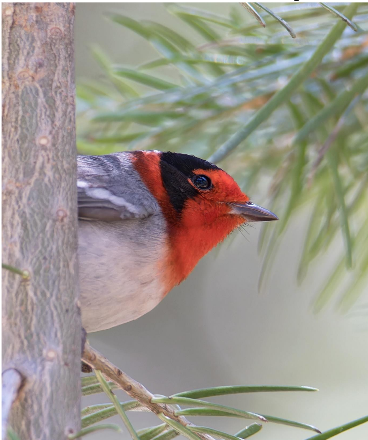
The stunning Red-faced Warbler is one of the major highlights of our trip to Arizona