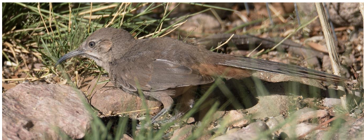
Crissal Thrasher