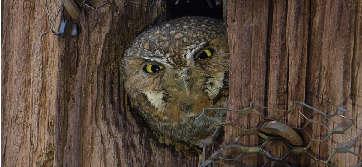
Elf Owl

There was a pair nesting in a sycamore tree next to our lodge in Portal. We saw two fluffy young in the nest and one evening found the adult hooting on a chimney.