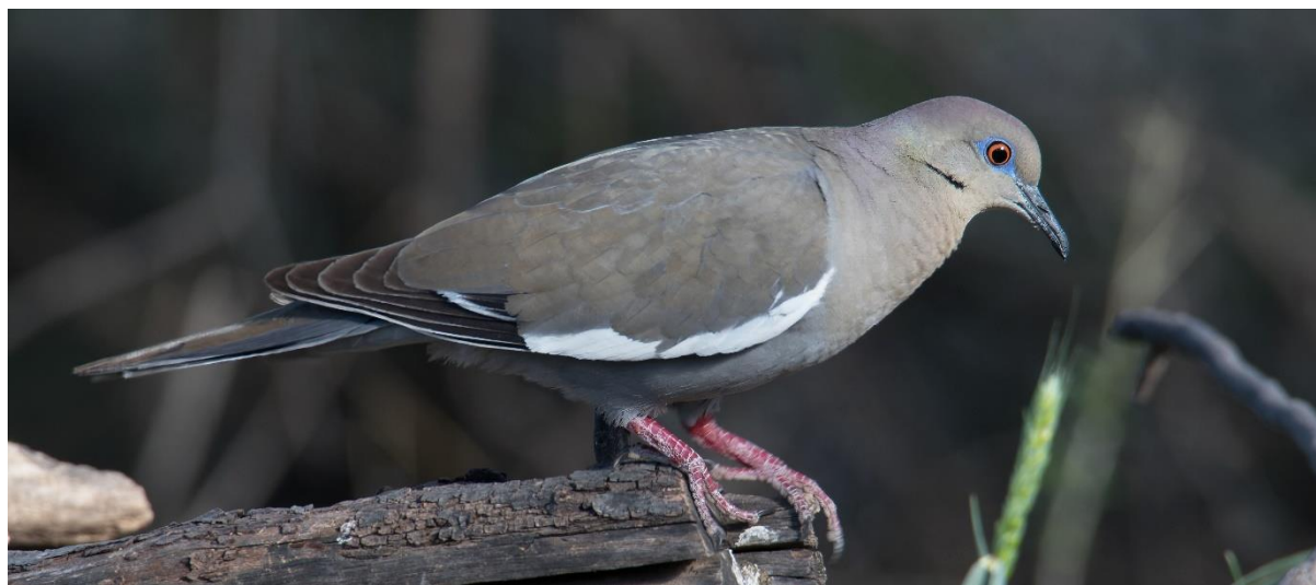
White-winged Dove