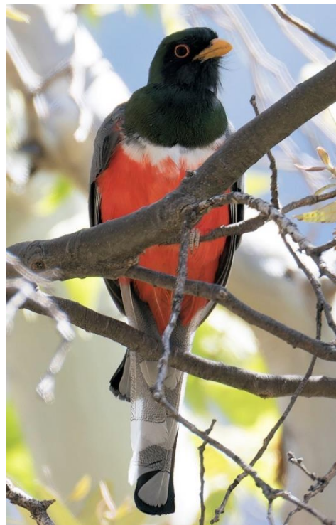
Elegant Trogon

A male was also heard and briefly seen at the Bledsoe Loop Trail at Ramsey Canyon Nature Preserve, and another male was seen in South Fork Cave Creek Canyon near Portal.