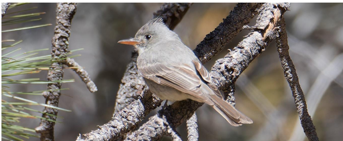
Greater Pewee

Found in the Huachuca Mountains at the Reef Townsite Campground, Carr Canyon. Also at Rustler Park in the Chiricahua Mountains.