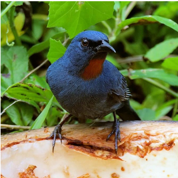
Orangequit, Jamaica

With an early start planned for today, after lunching at Green Castle, we will take time out this afternoon to relax at the lodge, perhaps have a siesta or enjoy the estate's swimming pool. There are, of course, the extensive ground to continue exploring and there will be an afternoon guided walk for those who wish to participate. Night Green Castle