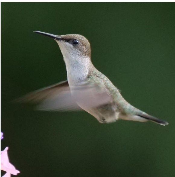
Vervain Hummingbird is only found on Jamaica and Hispaniola

A first gentle stroll could involve a Jamaican Mango, Jamaican Vireo or Jamaican Woodpecker and a fantastic range of species can be seen in the