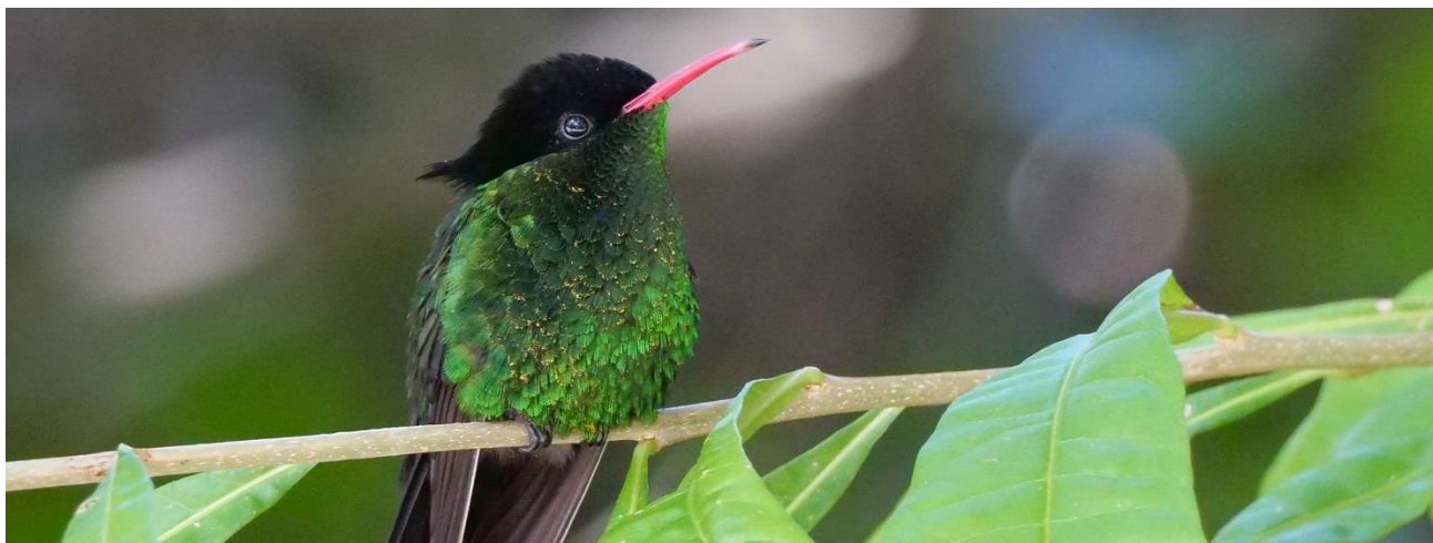
The stunning Red-billed Streamertail is one of 28 bird species that are unique to the island we hope to find

Single-centre, small group tour with Stuart Elsom & local guides